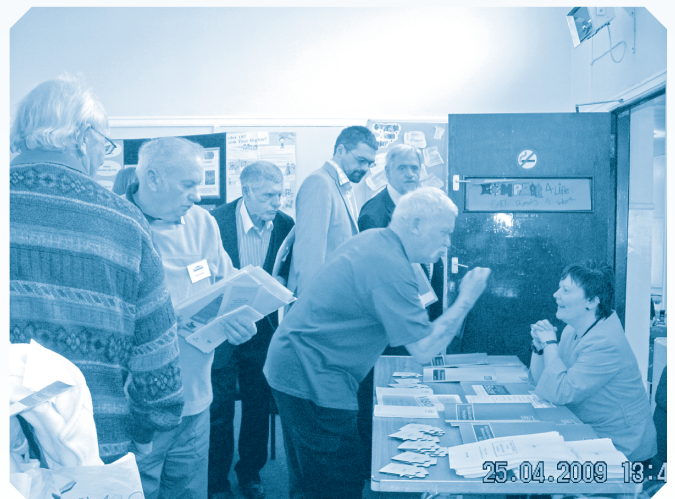
Joint Landlord Tenants' Conference 2009