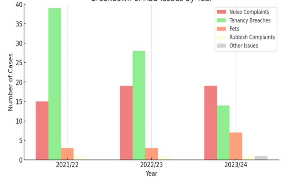
Breakdown of ASB Issues by Year